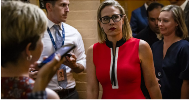
Sen. Kyrsten Sinema

Sens. Joe Manchin (D-W.Va.) and Kyrsten Sinema (D-Ariz.) are privately advising the nine House centrist lawmakers trying to force Speaker Nancy Pelosi to hold a quick vote on the Senate-passed bipartisan infrastructure deal, lawmakers and aides tell Axios.