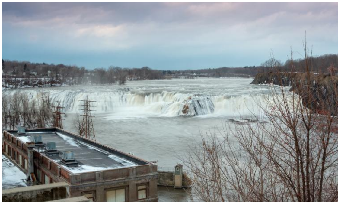
The Cohoes Falls on the Mohawk River in Cohoes, New York.