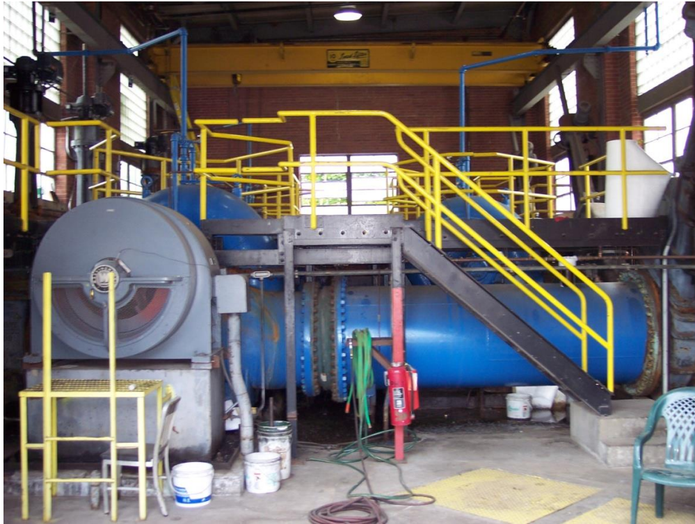
Figure 2-3 Greenidge Unit 4 circulating water pump A.